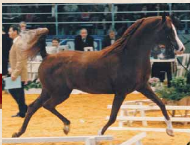
TOP: *EL NABILA B'S SIRE KUBINEC. BOTTOM: EL NABILA B'S DAM 218 ELF LAYLA WALALA B.